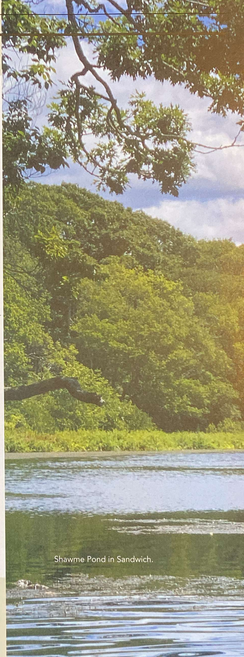
Shawme Pond in Sandwich.

Whether you stick with pond kayaking or mix it up with sea kayaking, paddling is a wonderful way to enjoy the Cape and the islands. "It's one of the most relaxing experiences you'll ever have," Morrison says. 🌀